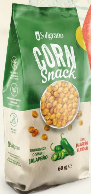
Jalapeño flavour Corn Snack