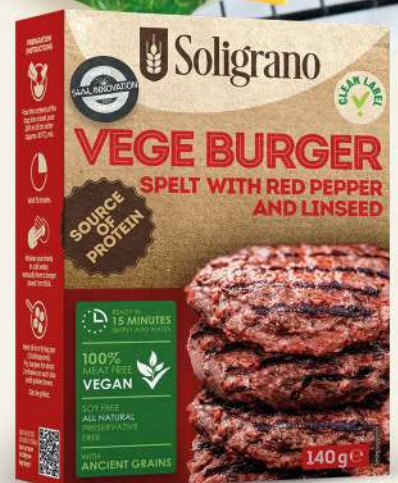
Vege burger with spelt, peppers and linseed 140 g