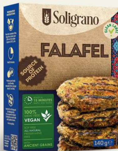
Falafel with chickpeas and spelt 140 g