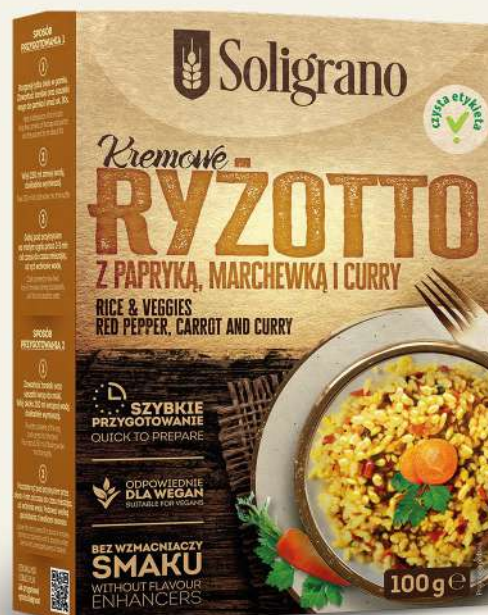
Rice & Veggies with pepper, carrot and curry 100 g