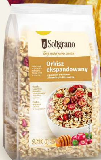
Spelt in honey with cranberries 150 g