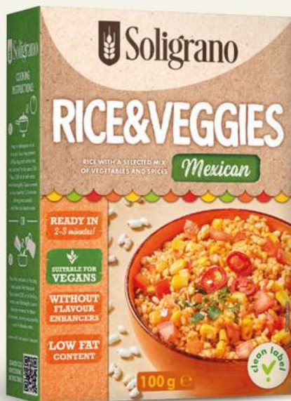
Rice & Veggies Mexican flavour 100 g