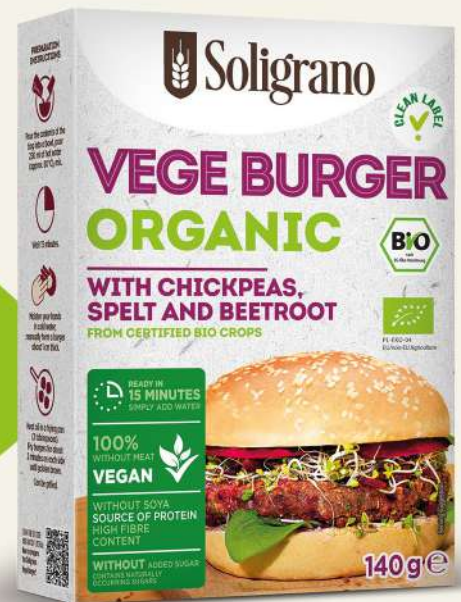
Organic Vege burger with chickpeas, spelt and beetroot 140 g