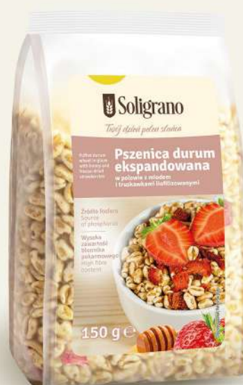
Durum wheat in honey with strawberries 150 g