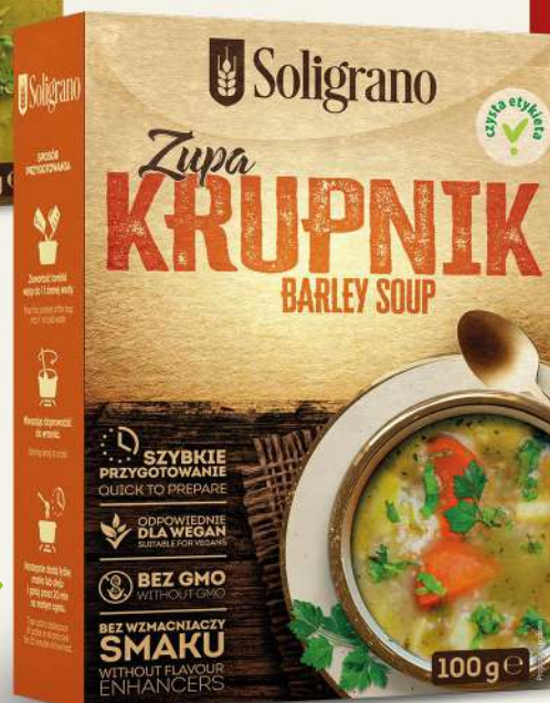
Barley soup 100 g