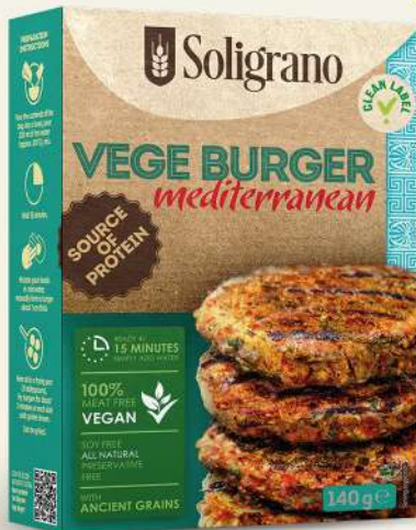
Vege Burger Mediterranean flavour 140 g

Vege Burgers Soligrano are mixes for self-preparation of healthy, aromatic vegetable burgers.