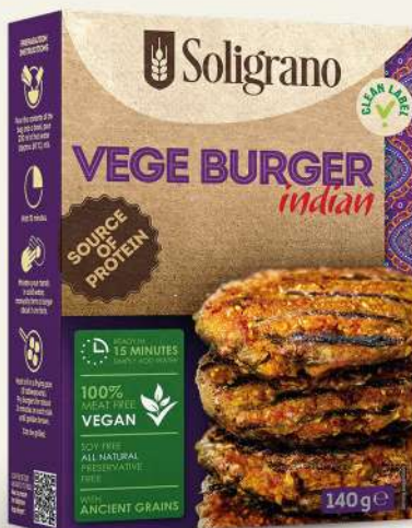
Vege Burger Indian flavour 140 g