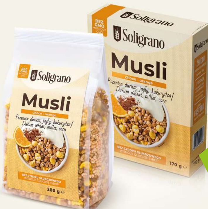
Muesli with choco and orange flavour 200 g / 170 g

Start your day with our Full Grain Muesli. A good day begins with breakfast, with the energetic portion of joy and sun coming from golden grains. The power of our grains come from their natural richness.