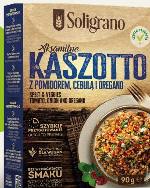
Spelt & Veggies with tomato, onion and oregano 90 g

Carefully selected mixtures of puffed grains with additives, thanks to which you can quickly prepare a healthy meal.