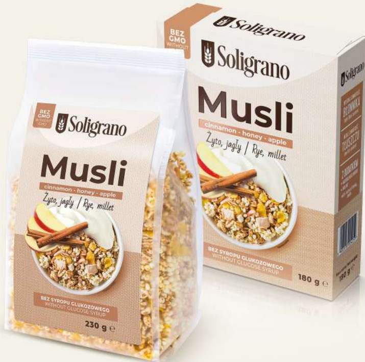
Muesli with Cinnamon, honey and apple flavour 230 g / 180 g

with milk, yoghurt, as a snack - eat and crunch as you like!