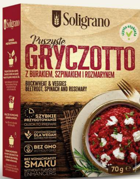
Buckwheat & Veggies with beetroot, spinach and rosemary 70 g