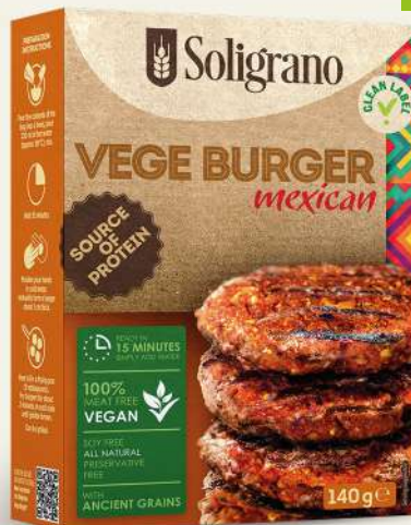
Vege Burger Mexican flavour 140 g