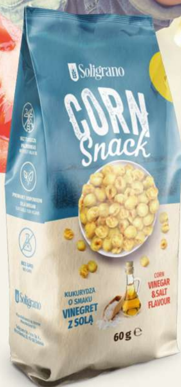
Salt & Vinegar flavour Corn Snack