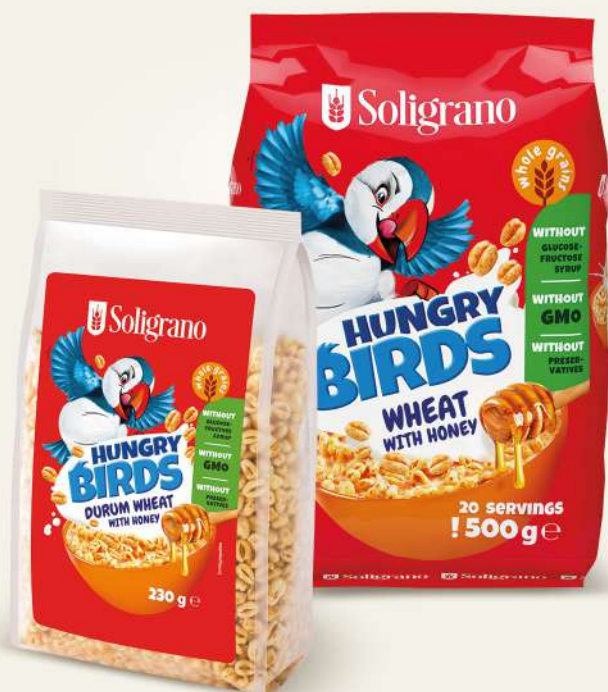
Wheat with honey 500 g / 230 g

Meet the Puffin, hero of breakfast products for children.