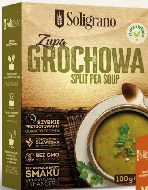
Pea soup 100 g