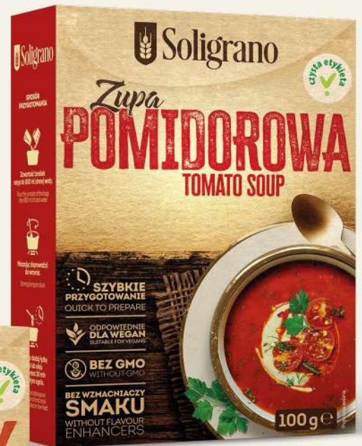
Tomato soup 100 g