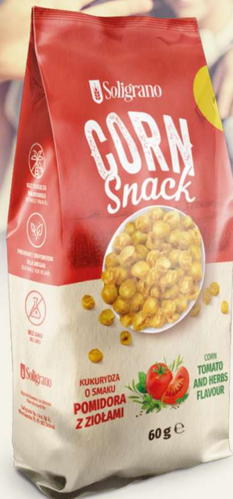
Tomato & Herbs flavour Corn Snack